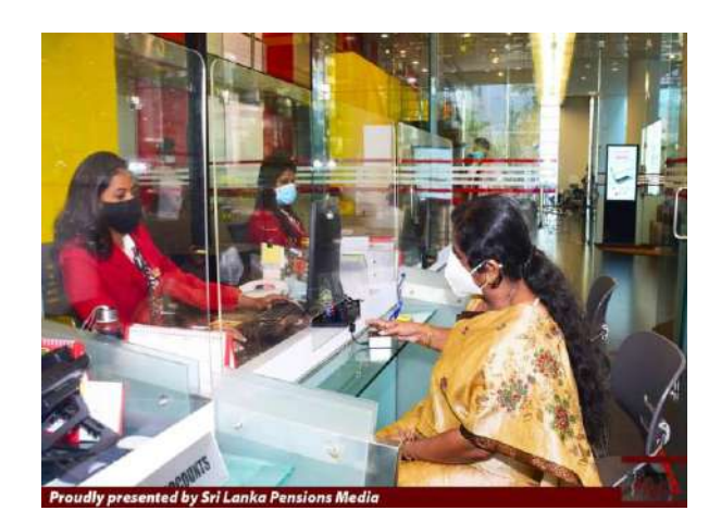
Facility at Seylan Bank to provide annual life certificates on fingerprint method.

The facility to submit life certificates on fingerprint method has been provided by Pensions Circular No.02/2020 (Revision VII) dated 01.02.2022 via 75 branches of Seylan Bank and in terms of Pensions Circular No.02/2020 (Revision VIII) dated 21.11.2022, this facility has been further expanded through 90 branches of Bank of Ceylon. Currently, this facility is available in 26 Divisional Secretariats and 476 bank branches such as Pan Asia Bank, Peoples' Bank, National Savings Bank, Regional development Bank Branches, Seylan Bank and Bank of Ceylon Island wide.